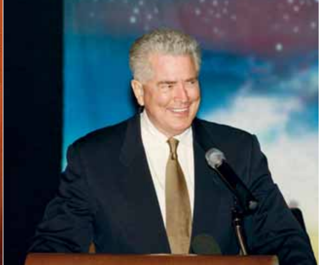
Huell Howser, host of several PBS television programs was the evening's master of ceremonies.