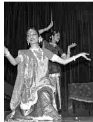
Members of the Orange County-based Shivam Arts dance company perform traditional Indian dances.