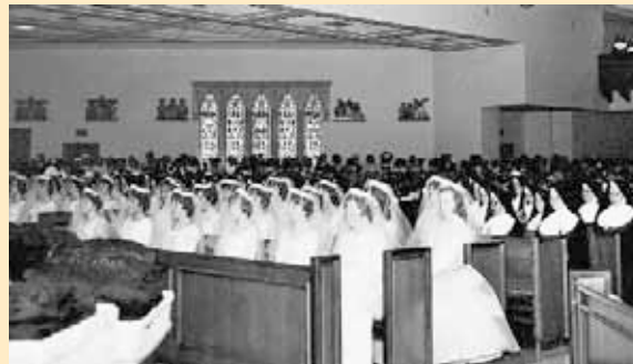
Reception and Profession of Vows ceremony for new CSJs in the House of Studies Chapel in 1964.