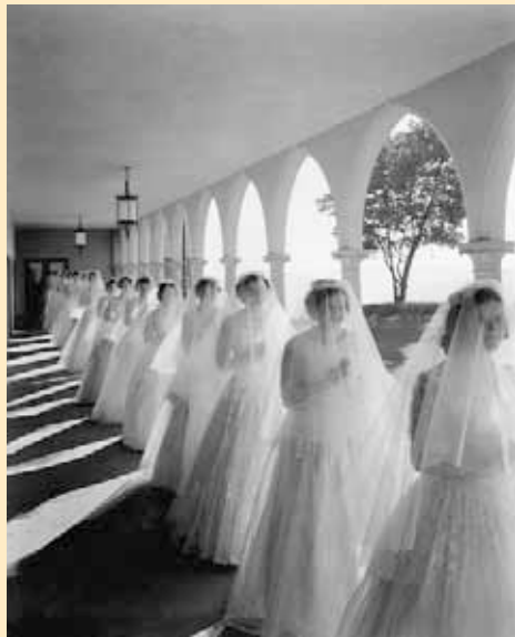
CSJ postulants gather at the House of Studies before going to the Mount's Mary Chapel for Reception in 1956.