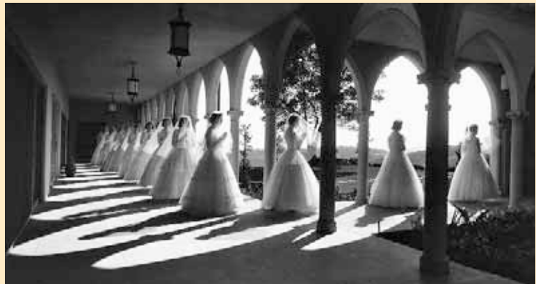
Reception Procession into Chapel at the House of Studies (now Carondelet Center) in 1959. These young women were received into the Community of the Sisters of St. Joseph of Carondelet.