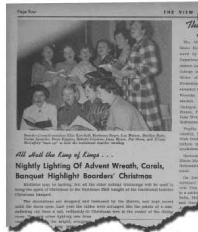
MOUNT ST. MARY'S THE VIEW, DEC. 13, 1951